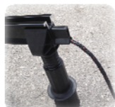
SP13 – Support cord/rope

The cord passes all the way through each beam and is anchored outside the perimeter of the pond using either ground stakes (SP15) or ceiling anchors (SP16). Excess cord is then cut away. Alternatively, a hole can be drilled 7cm from the end of the beam, on the underside, and a shorter length of rope used and a simple knot tied.